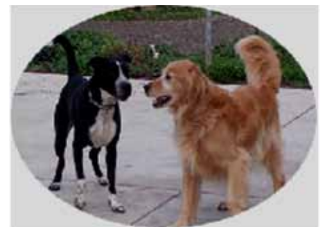
Rocco and Shakespeare in the play yard.

You are invited to sign up online at www.inavalefarm.com/kennel to receive this newsletter by e-mail.